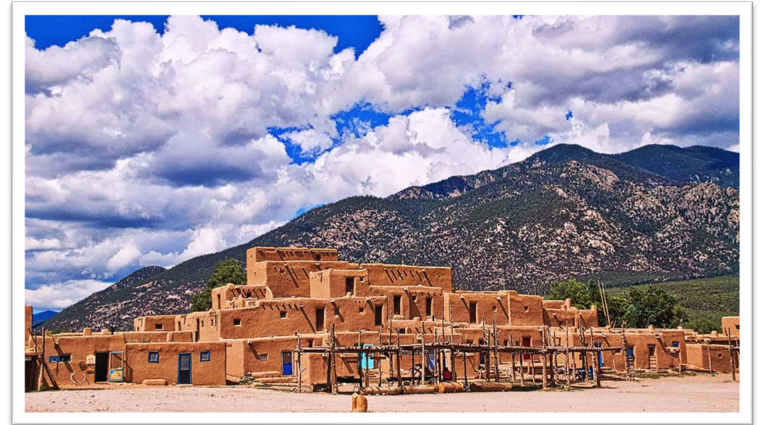
A cloudy morning looking over Taos Pueblo

Learn more: About Taos Pueblo at Taospueblo.com